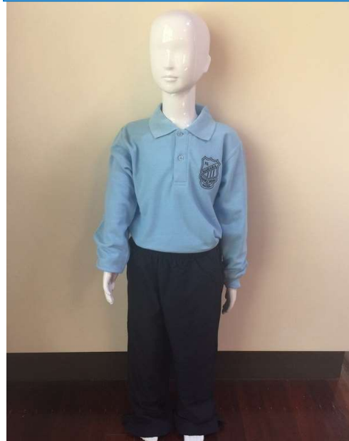
Long Sleeve Polo

EXTRA: Plain sky blue or navy blue long-sleeved t-shirt can be worn under school Polo shirts/Peter Pan blouses.