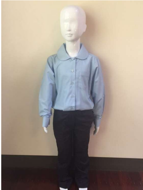
Peter Pan blouse

EXTRA: Plain sky blue or navy blue long-sleeved t-shirt can be worn under school Polo shirts/Peter Pan blouses.